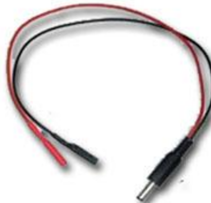
DC Power Cord